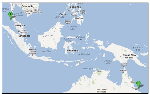
Figure 1: CREON sites. (A) Racha Island, Thailand and (B) Davies Reef on the Great Barrier Reef, Australia

CREON sites such as Davies Reef (Lat: 18.83S, Long: 146.63E) on the Great Barrier Reef in Australia and Racha Island (Lat: 7.60488N Long: 98.3766E) in southern Thailand (Fig. 1a,b), were used as source sites for the integration work.