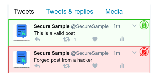
Figure 3: Example of post verification on Twitter.

signatures (i.e. those posted without using the app) and non text-based posts are not verifiable and are marked accordingly. The plug-in also automatically hides signature images in post bodies from the user, reducing the visual overhead of embedding images in every verified post.